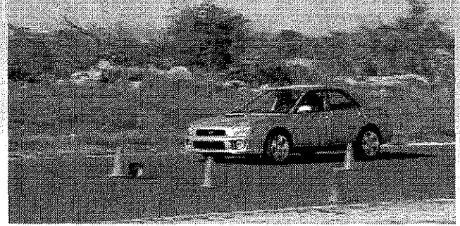
Earl Huang in his new WRX equipped with Audi wheels and set the 3rd fastest time of the day.

would stand till the last run when Alan Vidao cracked a 50.789 on his last pass! ( you can see all the times on page 6) Thus taking the Top Student honors.