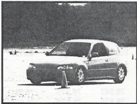
Bryson Fukuda Piloting "Smurfette" In EP

Has anyone noticed that it seems to be raining more frequently than last year? For instance, it's been raining for the past 3 race weekends. Fortunately, the sun smiled upon us just before we began racing on all these events. Of course the winds were heavy again this month, causing the tent to blow over again, this time narrowly missing a car.