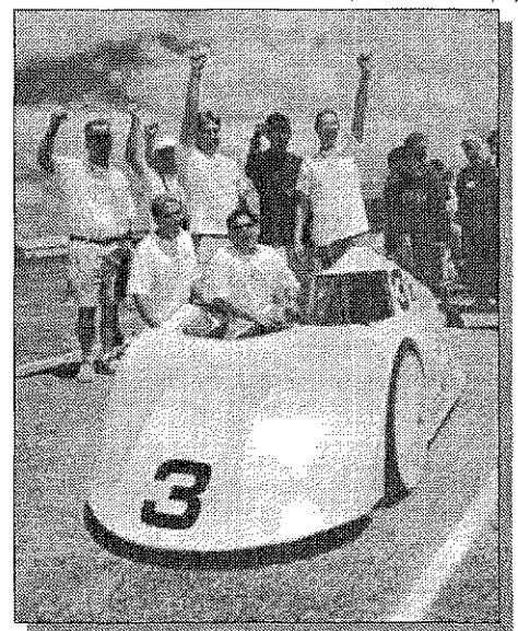
The West Hawaii Preparatory Academy winner.