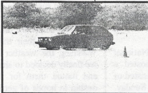
"A Little Too Fast...National Caliper Course", You Say?

How did you like the track? Maybe a little too fast? Well there were elements of a "national caliber" course in there. We will try to keep the same flavor, but maybe slow it down a bit as there were quite a number of DNFs because of the high speeds. I for one had difficulty with the end of