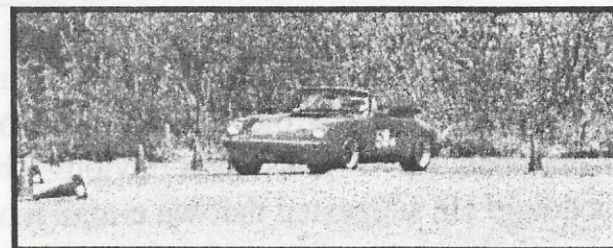
Collyer Young, 1988 911 Carrera