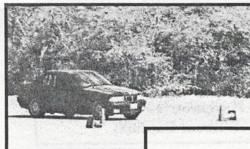
Ed Kemper's BMW E36 325is

You may have noticed the new additions to our race results. The "PAXTime" and "PAX" ranking. The PAX index numbers are derived from a database over the years based on the national times from the various classes. The PAX time effectively removes the "car factor" from the time equation, thus you can compare directly how you did against any driver because the times are now weighted to equal out all the car classes. So in theory, although I finished 22nd overall, I really finished 11th had we all been racing the same car and I would need to make up 1.154 seconds to catch the next fastest driver, Darrell Wong in his Porsche Boxster.